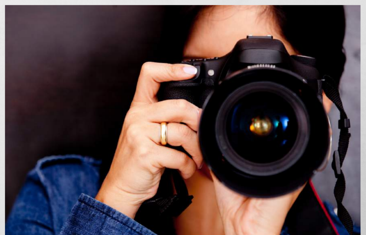
Real Estate Photographer