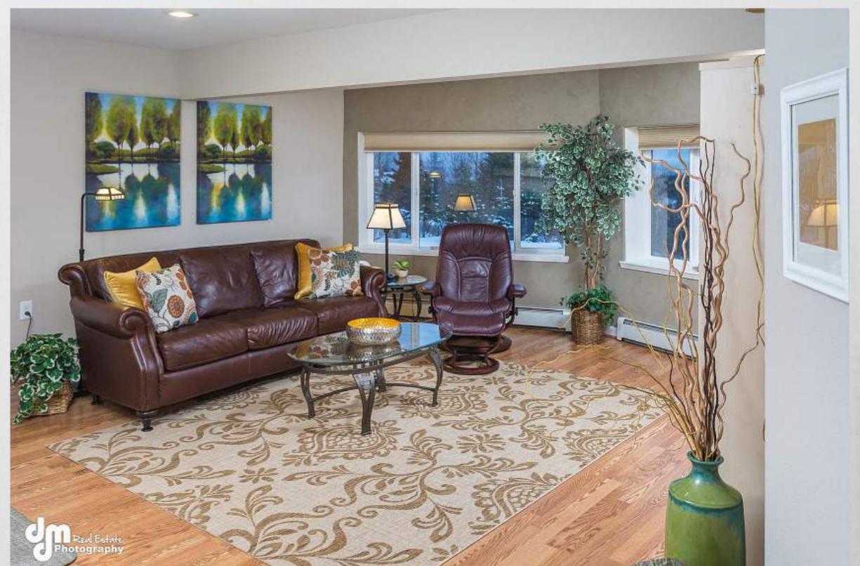
Interior Photos by DMD Real Estate Photography